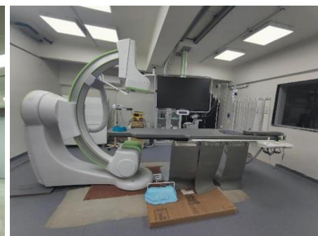
Cardiology PACS Lab