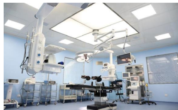
State Cancer Unit (OT), Jaipur